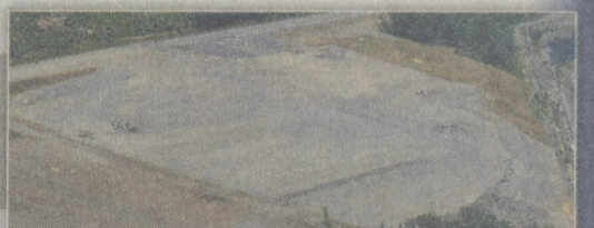
Parcel 26A Technology Dr. • CenterPoint East 11.3 acres • Building size: 124,000 Sq. Ft.