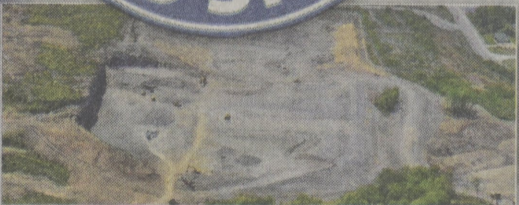
Parcel 44A Research Dr. • CenterPoint East 24.619 acres • Building size: 260,400 Sq. Ft.