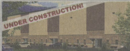
Parcel 8, Alberigi Dr. • Jessup Small Bus. Center 10.02 acres • Building size: 96,000 Sq. Ft.