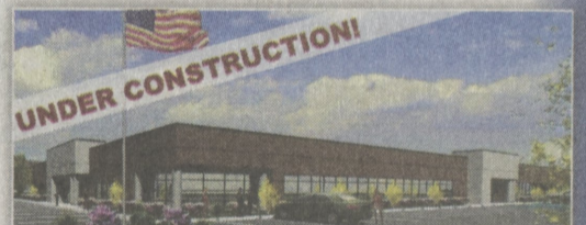
1155 East Mountain Blvd. • East Mtn. Corp. Ctr. 6.6 acres • Building size: 42,000 Sq. Ft.