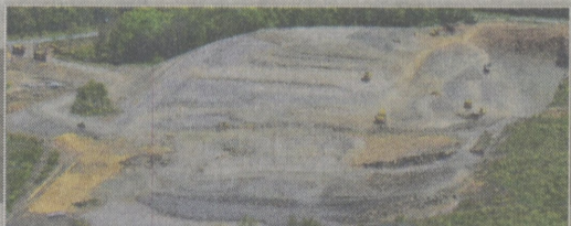
Parcel 44B Research Dr. • CenterPoint East 21.68 acres • Building size: 260,400 Sq. Ft.