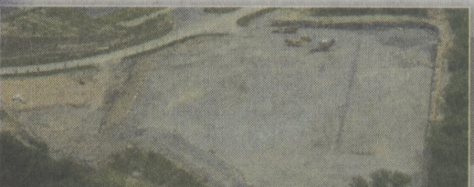
105-155 Research Dr. • CenterPoint East 12.85 acres • Building size: 109,200 Sq. Ft.