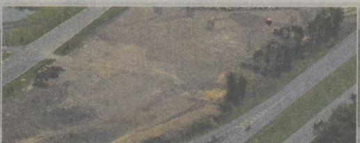
Parcel 3B Keystone Ave. • CenterPoint East 4.02 acres • Building size: 86,044 Sq. Ft.