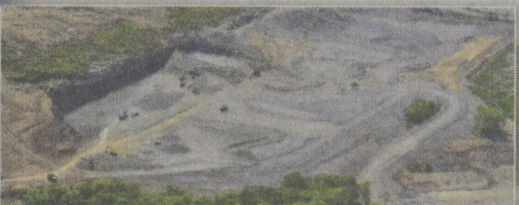
Parcel 46A Research Dr. • CenterPoint East 27.36 acres • Building size: 235,600 Sq. Ft.