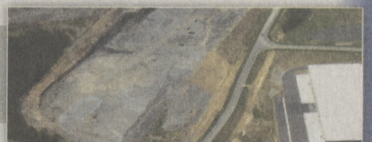
250-300 Research Dr. • CenterPoint East 46.47 acres • Building size: 372,000 Sq. Ft.