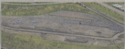
360 Enterprise Way • CenterPoint West 21.78 acres • Building size: 160,000 Sq. Ft.