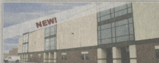
345 Enterprise Way • CenterPoint East 18.48 acres • 6,427 Sq. Ft. to 81,037 Sq. Ft. available