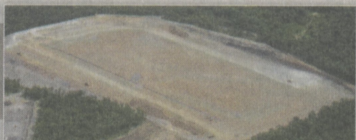
Parcel 26, Technology Dr. • CenterPoint East 56.1 acres • Building size: 775,000 Sq. Ft.