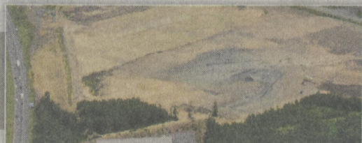
Parcel 6 Keystone Ave. • CenterPoint East 32.12 acres • Building size: 259,200 Sq. Ft.