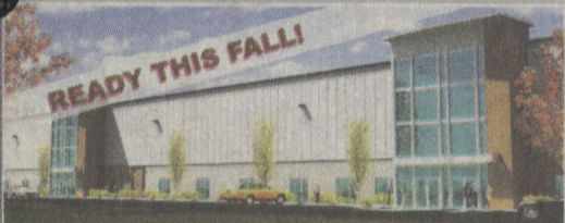
501-575 Keystone Ave. • CenterPoint East 22.78 acres • Building size: 120,000 Sq. Ft.