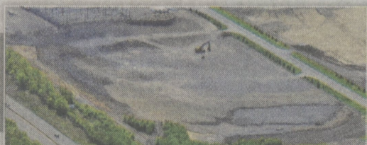
Parcel 8 Keystone Ave. • CenterPoint East 13.75 acres • Building size: 135,200 Sq. Ft.