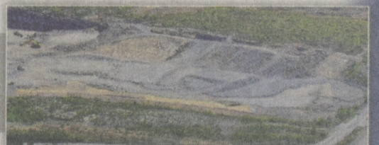
Parcel 46B Research Dr. • CenterPoint East 28.781 acres • Building size: 235,600 Sq. Ft.