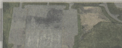
250 Enterprise Way • CenterPoint West 51.15 acres • Building size: 507,600 Sq. Ft.