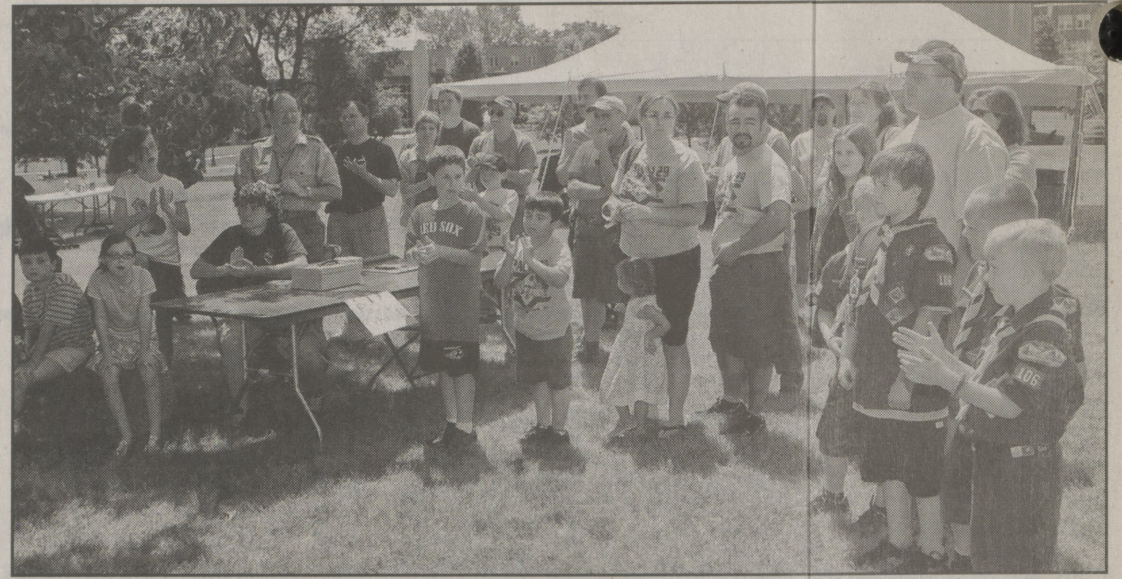
Parents and fellow scouts applaud winners of the 2012 Northeast Pennsylvania Council Pinewood Derby.

The Lehman-Idetown United Methodist Church summer worship services will be held through Aug. 19. This will include an 8:30 a.m. contemporary worship service and a traditional service at 10 a.m. A coffee break will be from 9:30 to 9:55 a.m.