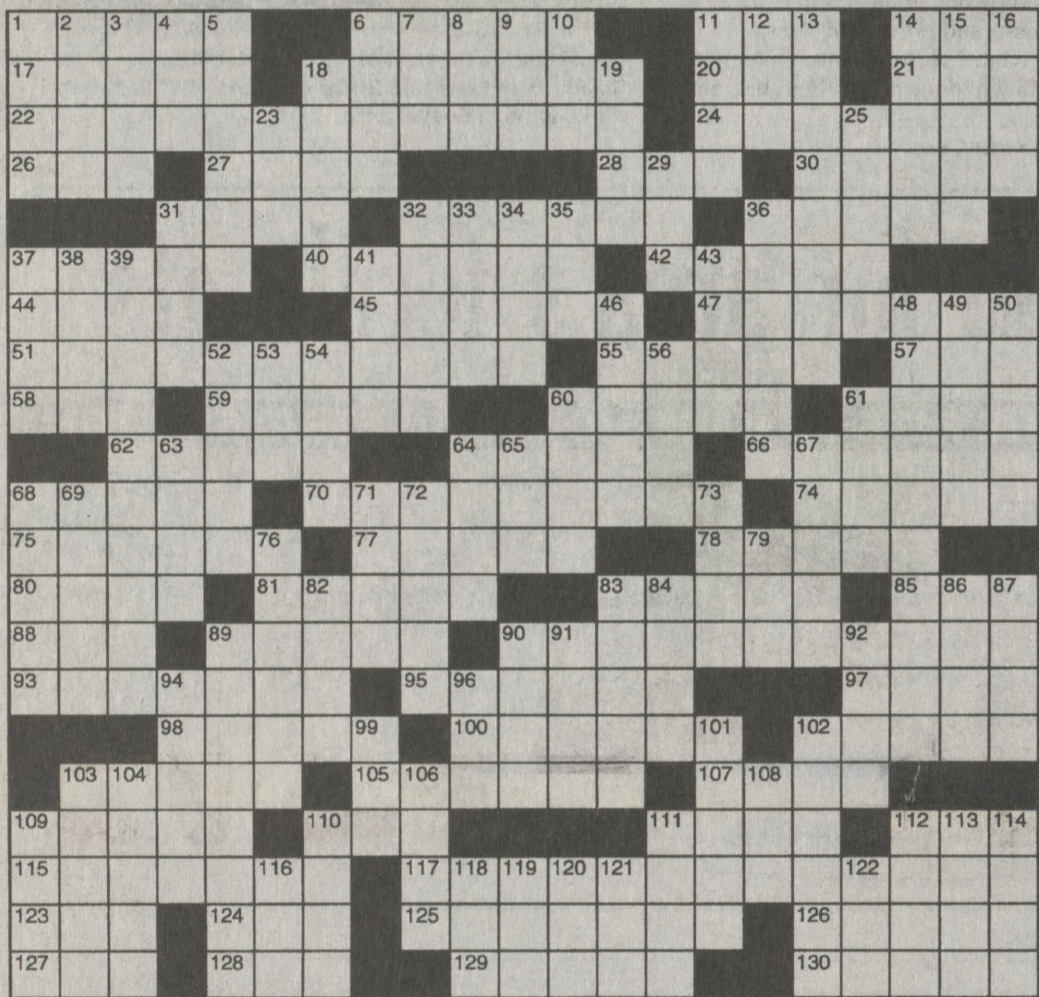
© 2012 King Features Synd., Inc. All rights reserved.