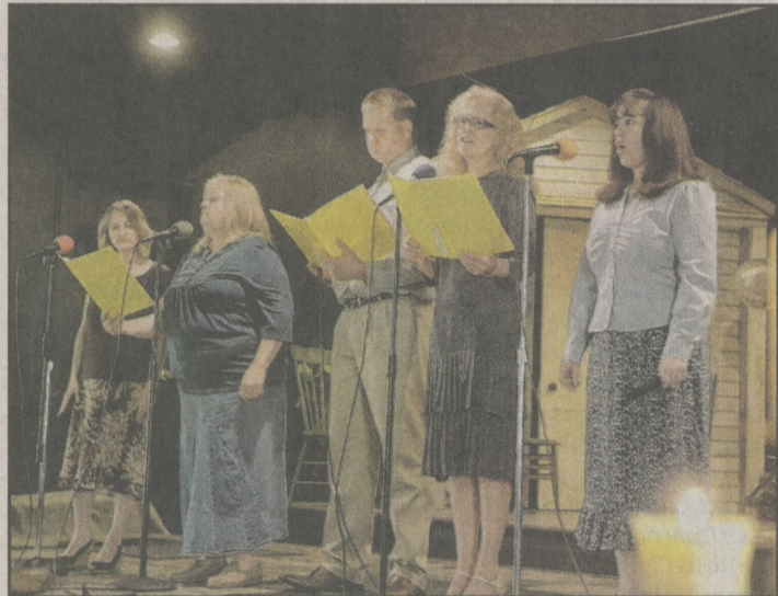
The Apostolic Faith Tabernacle Choir performs 'The Old Time Way' during a 30th anniversary service at the church.