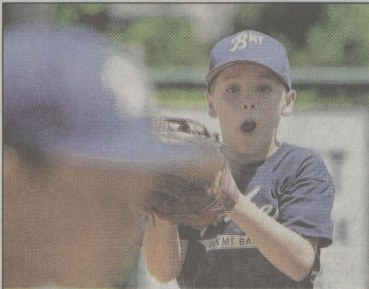
Yankees second baseman Derek Answini readies to make a throw during a rundown of an Orioles player.