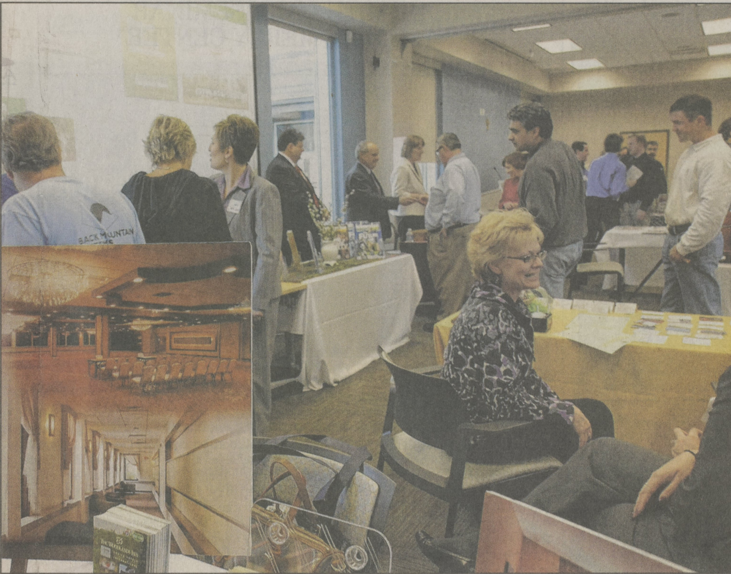
Misericordia University has hosted the Back Mountain Business Association's annual Business Expo and workshops for the last three years. This year will be the first expo sponsored by the newly formed Back Mountain Chamber of Commerce.