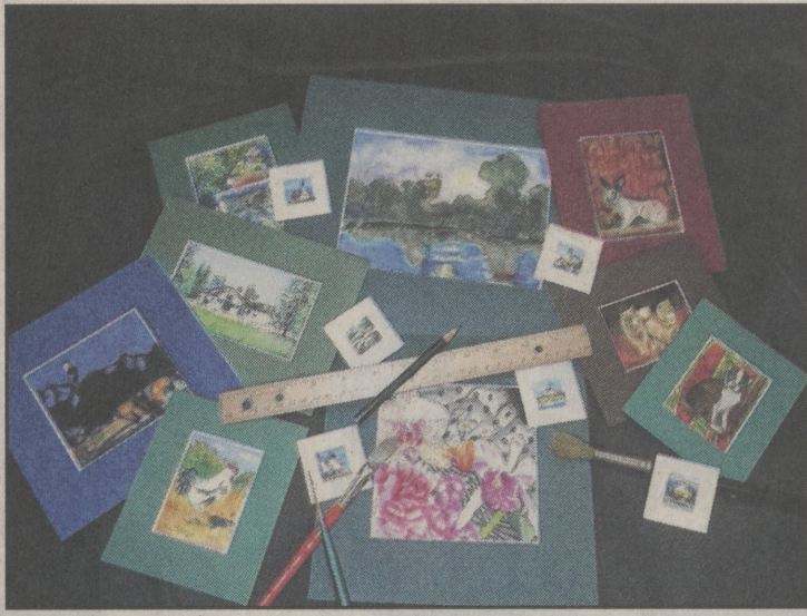
Miniature artworks by art students of Sue Hand's Imagery will be displayed during the studio's Spring Exhibit.

The exhibit will include miniature landscapes, seascapes, still lifes, animals and figure studies. Over two dozen of the artworks include small works and miniatures of The Lands at Hillside Farms and other local landmarks. Hand will exhibit miniatures in oil, acrylic and watercolor. A wide range of additional compositions will be exhibited by teen and adult students.