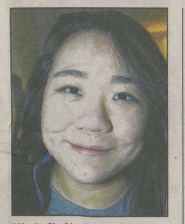
"I definitely like the weather because I like to play tennis."

• On March 28, 1979, the worst accident in the history of the U.S. nuclear power industry begins when a pressure valve in the Unit-2 reactor at Three Mile Island in Pennsylvania fails to close. As engineers struggled to understand what had happened, the reactor came within less than an hour of a complete meltdown.