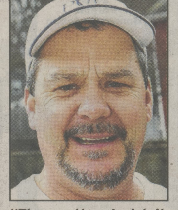
"The weather. I wish it was nice here all the time since I do carpentry and painting."