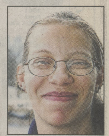
"Not having to bundle up. It's easier to walk to work and take the kids to the park."