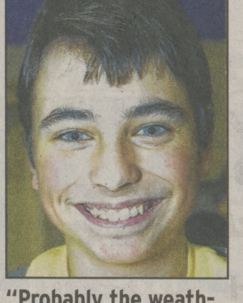
"Probably the weather. You're not cooped up and I'm looking forward to the baseball season."