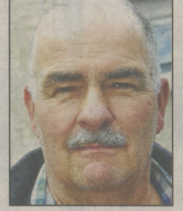
"It's warmer. I'm retired so I can get out and do some yard work."