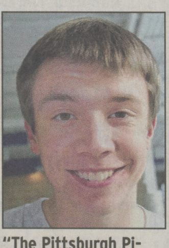
"The Pittsburgh Pirates because I used to live in Bethel Park in the Pittsburgh area."