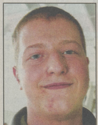
"The Phillies because they are closest to Dallas and my dad and grandparents like them."