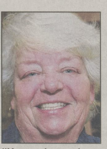
"My grandson and my husband like them so I guess I'll say the Phillies."