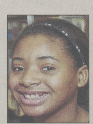
"The Phillies because they are such good fielders. I know because I play softball."