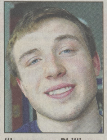
"I grew up a Phillies and think they are still pretty good."