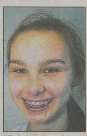
"To honor them because they did such a great job. Well, they all tried to do a good job."