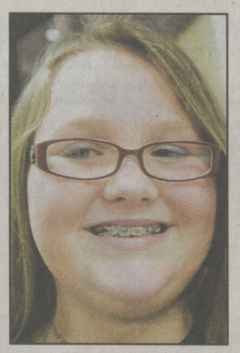
"To thank the presidents who helped our country in war and the ones who help fix the economy."