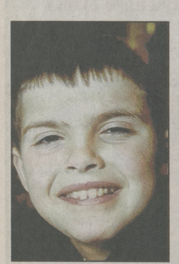
"Because they helped the country fight in wars and keep the country safe in peace time."