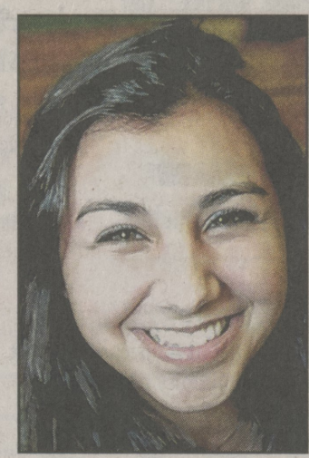
"To honor the presidents. After all, they did a lot of good things for us and they give good speeches."