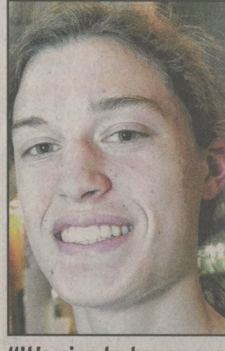
"It's nice to honor our history and the things the presidents accomplished. It's a patriotic thing."