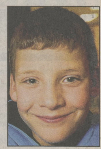
"Because they made our country free and send our soldiers to war."