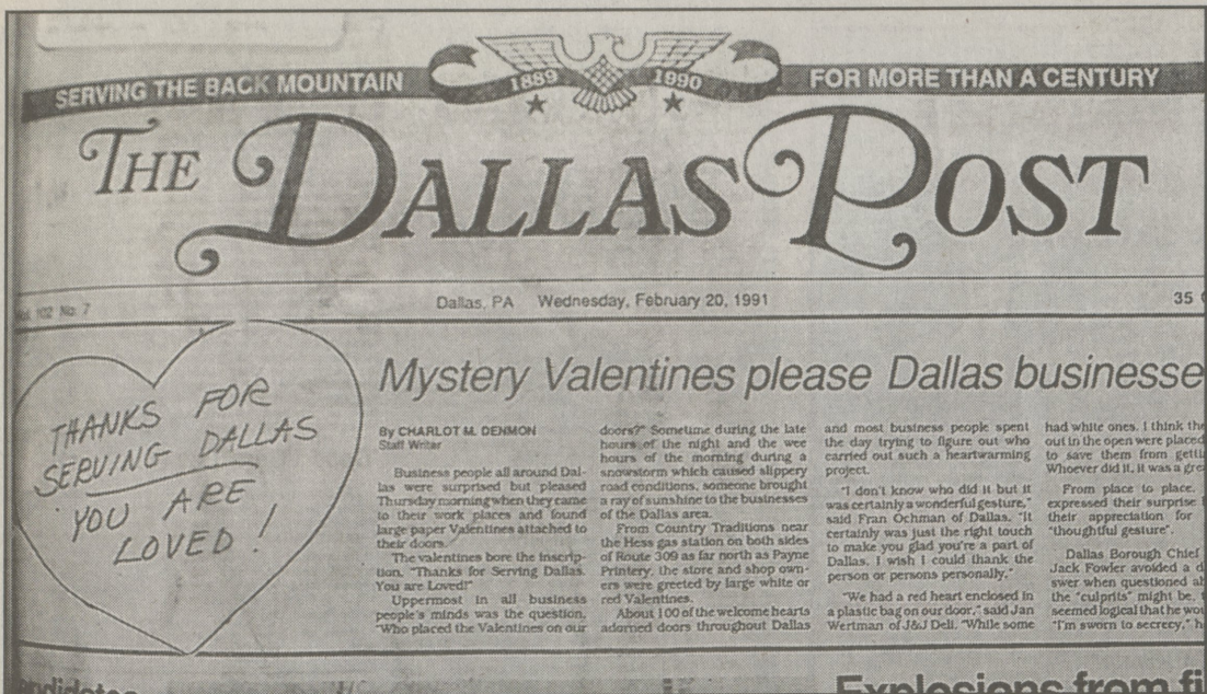
In 1991, The Dallas Post wrote about a Phantom Valentiner who posted red Valentine hearts on doors of Back Mountain businesses. Twenty-one years later, the secret Valentiner has confessed.