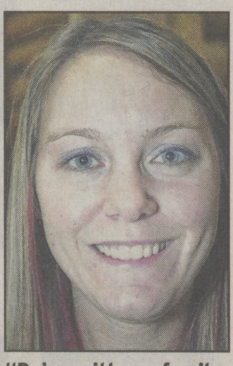
"Being with my family is always the best present."