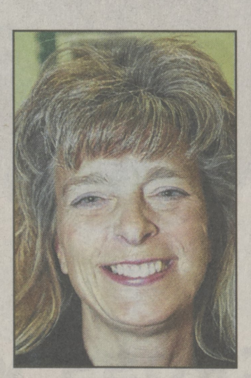
"I saw a Chatty Cathy doll in the Sears cataloque and it was all over. I was a victim of mass marketing."