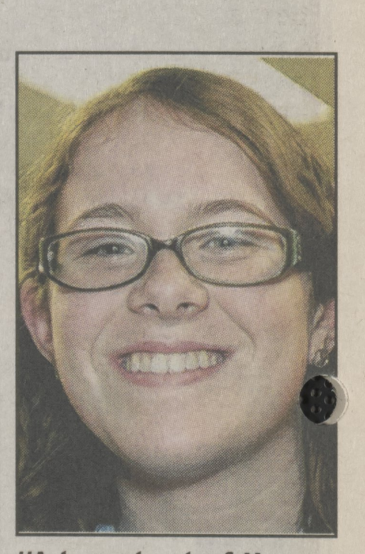
"A boxed set of Harry Potter books to read."