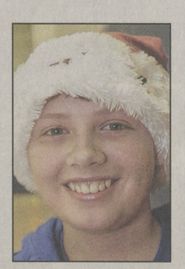
"Last year I got PS3 Playstation with three car racing games. It was the best."