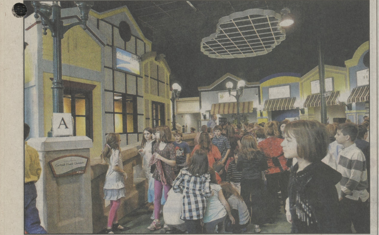
Dallas Elementary School fifth-grade students wander around Biz Town in Pittston, a mock town set