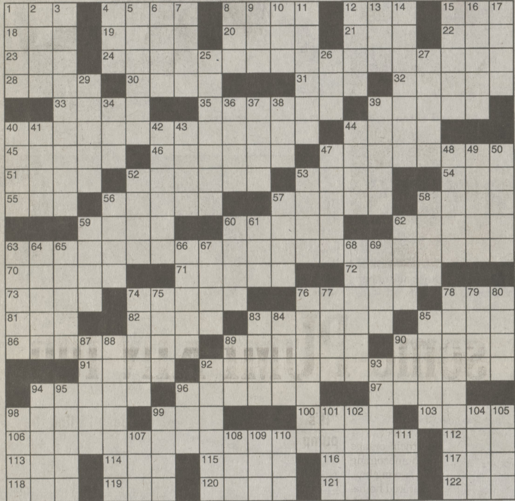
© 2011 King Features Synd., Inc. World Rights Reserved.