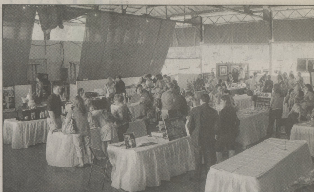
Attendees visit vendors in the Irem Pavilion during Irem Country Club's first bridal show since the opening of the new clubhouse and grand ballroom.

Complete details are available on the Schools Fight Hunger site.