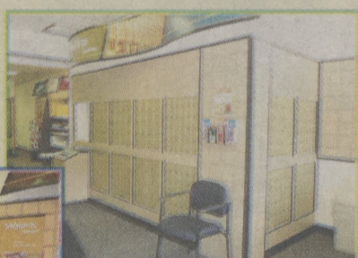
Get a mailbox that delivers more