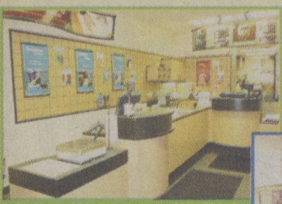
Let us help you with that.

Multi-tasking doesn't have to mean multiple locations.