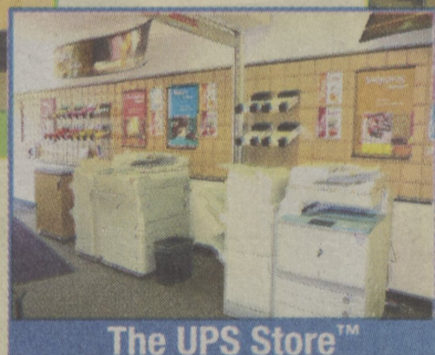
The UPS Store™