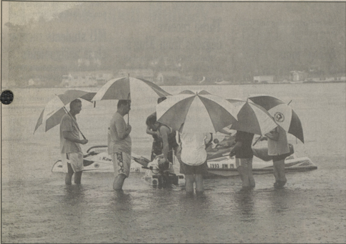
Judging the ski boat competition was both slippery and challenging.