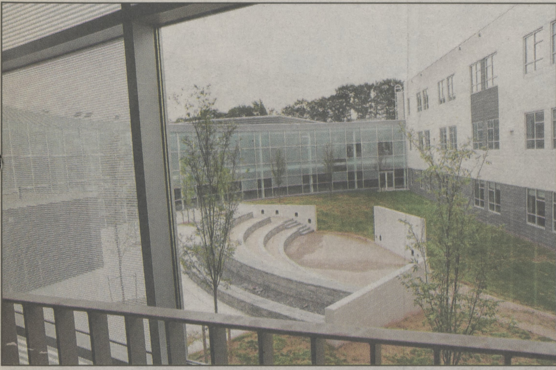
An outdoor amphitheatre features a projection wall for night-time viewing.