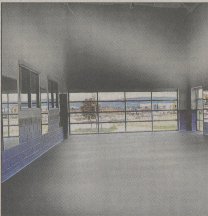
The new cardio-fitness room offers an outside entrance for possible access by the public.