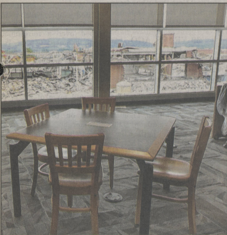
The view from the new library will improve as the old high school building is demolished to make way for a parking lot.