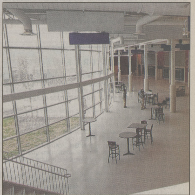
The interior courtyard will have drop-down TVs and an enclosed store where students can buy Dallas t-shirts and merchandise.