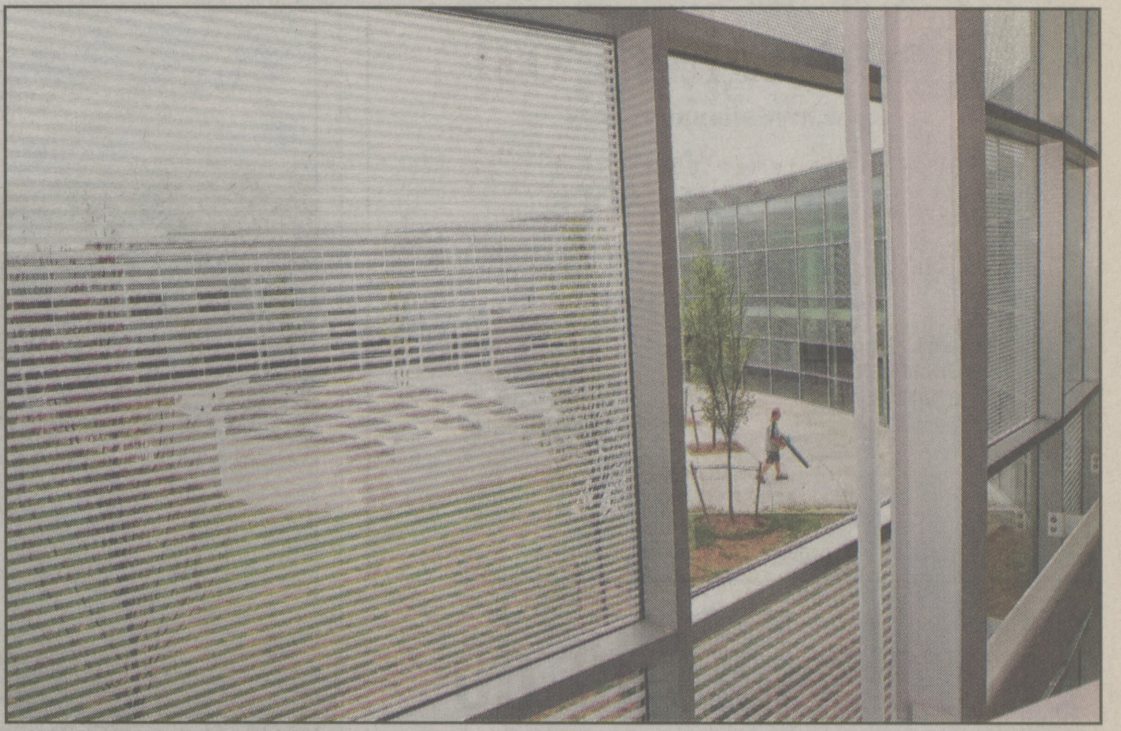
The new high school is a composite of buildings arranged together around a courtyard.