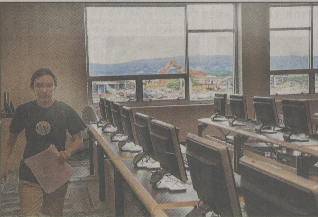
Workers hurry to finish setting up state-of-the-art computer labs.