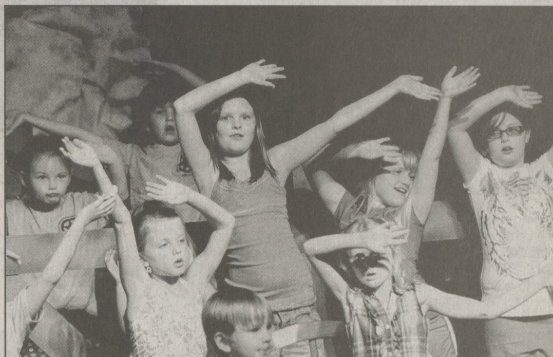
Children from the Sweet Valley Church of Christ sing praise songs during their Vacation Bible School party.

A Vacation Bible School Fun Fair was held on June 24 at the Sweet Valley Church of Christ.