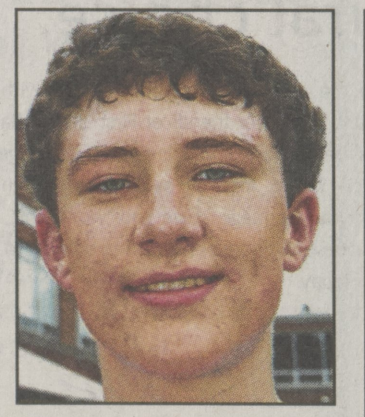
"The caring teachers, students and even the people in other grades in the school."