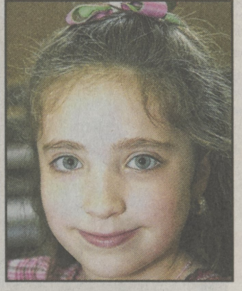
"My teachers and friends but, mostly, my school."