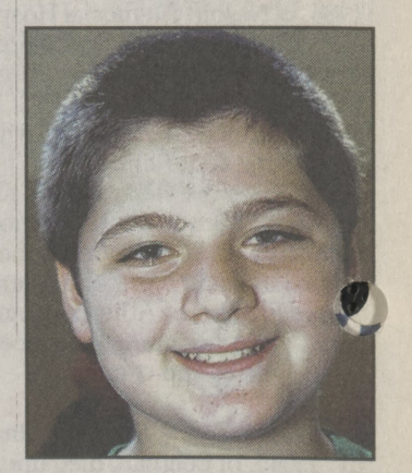
"This is a close small community school with all my friends around me."