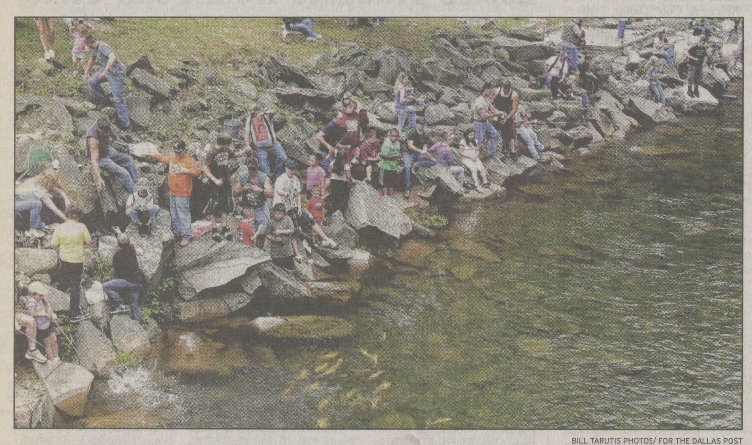
Dozens of youngsters and their parents compete at the Kids Trout Derby along Bowman Creek at the Noxen-Monroe Sportsmen's Association grounds in Noxen.