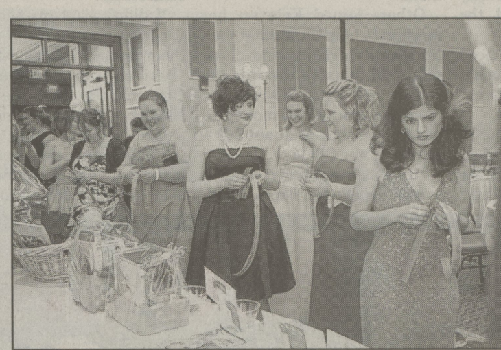
Prom-goers had the opportunity to take chances on raffle baskets.