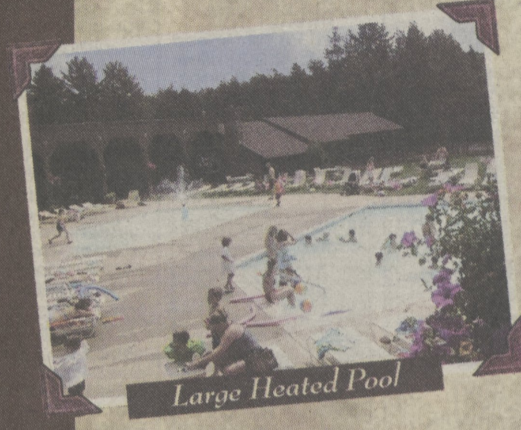
Large Heated Pool

Choose from a variety of budget friendly memberships!