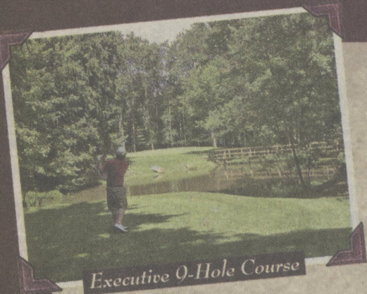
Executive 9-Hole Course

Discover the casual, family friendly atmosphere with all the comforts of a country club setting.