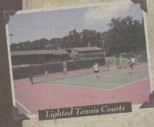
Lighted Tennis Courts

SAVE $200 ON ANY NEW MEMBERSHIP Join Newberry Country Club and we'll waive the $200 initiation fee. Call today for the details!