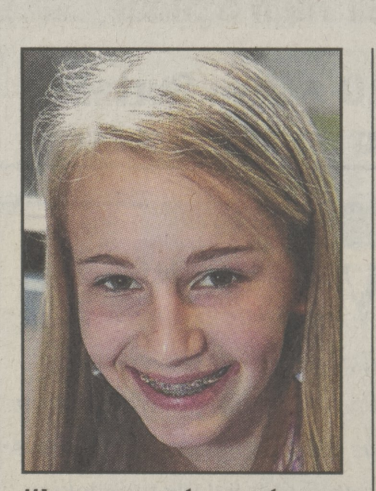
"I gave up desserts and ice cream and my dad eats them all."