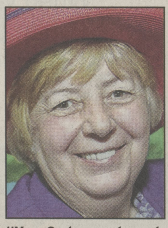
"Yes. Soda, candy and ice-cream and I'm dying."