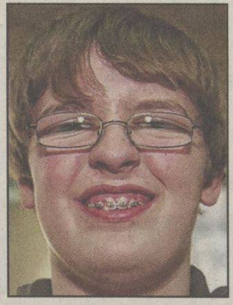
"Carbonated soda. I drink water or coffee."