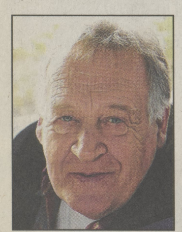
"No, not Catholic. We don't do that."