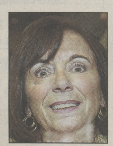
"I don't give up food but I attend Mass dailv."