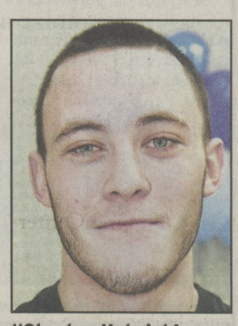
"Stanley Kubrick's '2001 Space Odyssey.'"