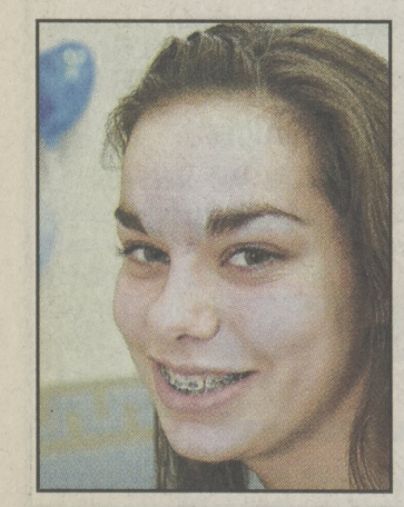
"'Dilemma.' It was so funny."