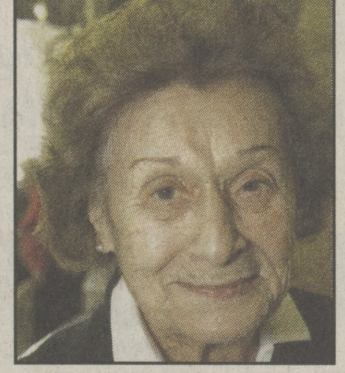
"FOX News, absolutely - at least four hours a day. I think it's very impartial news."