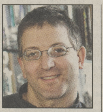
"I watch the EWTN network with the kids. There's much to learn about the Catholic faith."