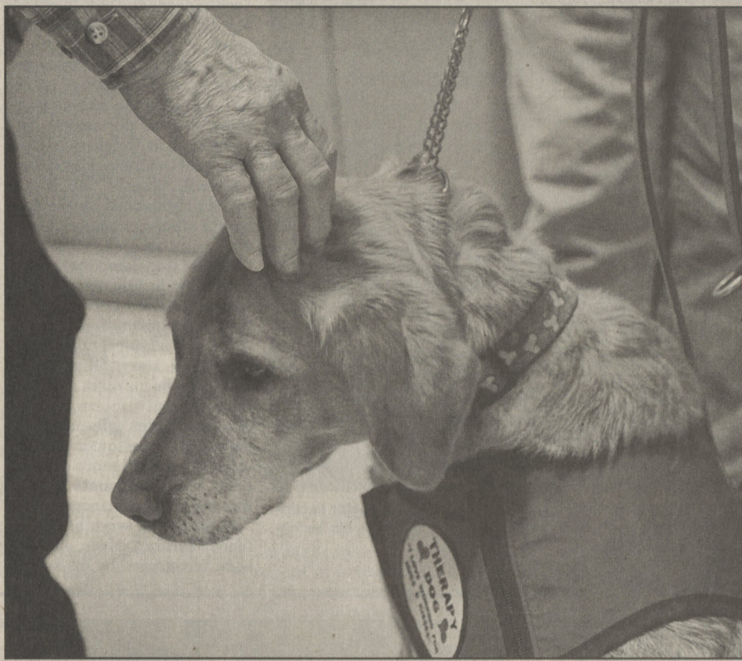
A resident of The Meadows Nursing Center pets Colleen, a yellow lab-golden retriever mix, from South Paws Therapy Dogs.