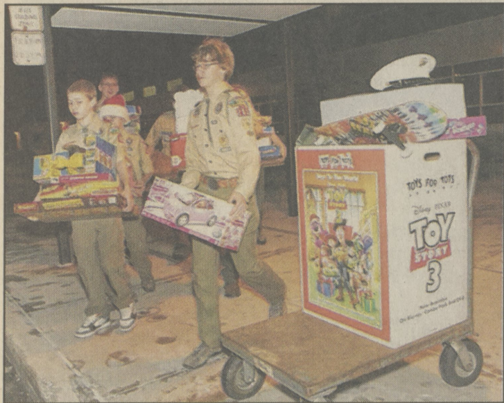
Older Scouts help load the toys donated to the U.S. Marine Corps Toys for Tots drive in a truck.

Cub Scout Pack 281 of Dallas held its annual toy collection for the U.S. Marine Corps Reserves Toys for Tots program. Scouts brought toys and representatives of the Marines Corps Unit in Wyoming attended the meeting to accept the toys.