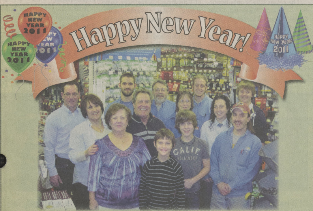
Happy New Year From All Of Us At Dallas Centre Hardware. Thank You For Your Continued Patronage and Support