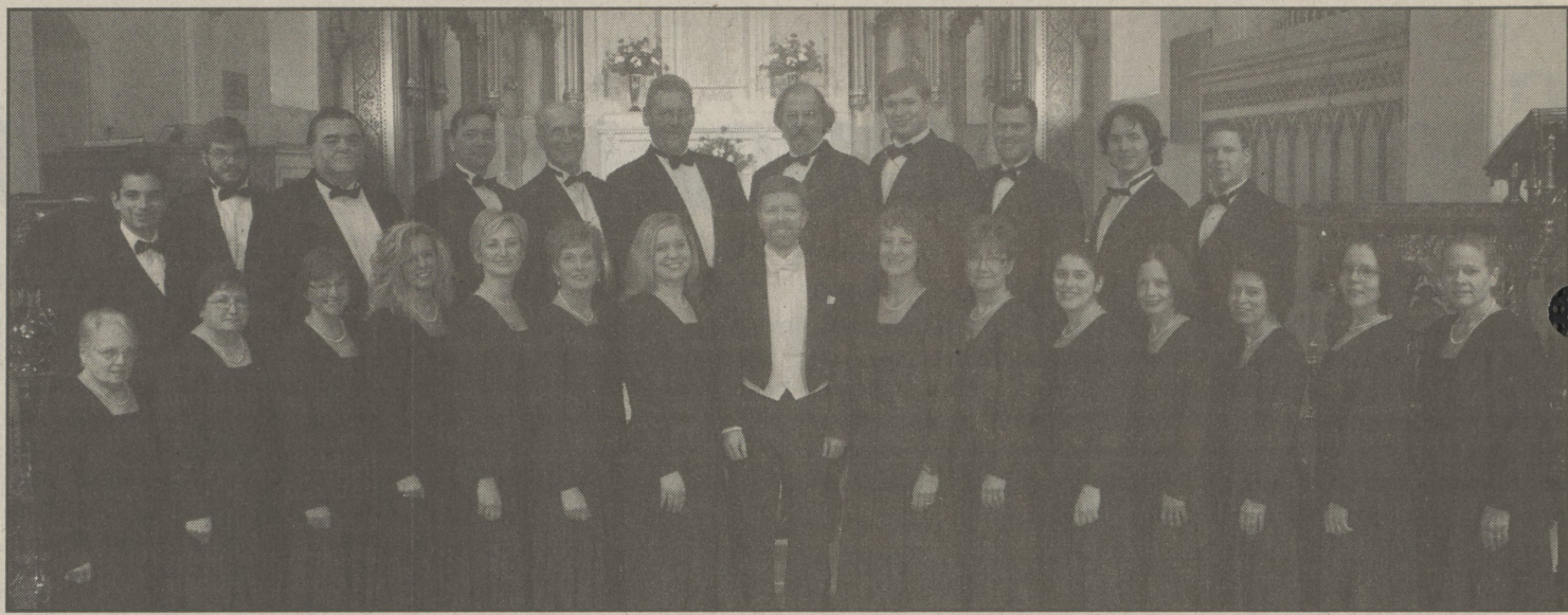
The Robert Dale Chorale will present the 27th Annual Messiah Sing-Along at 3 p.m. on Sunday, Dec. 19 in St. Stephen's Episcopal Church, 35 S. Franklin St., Wilkes-Barre.