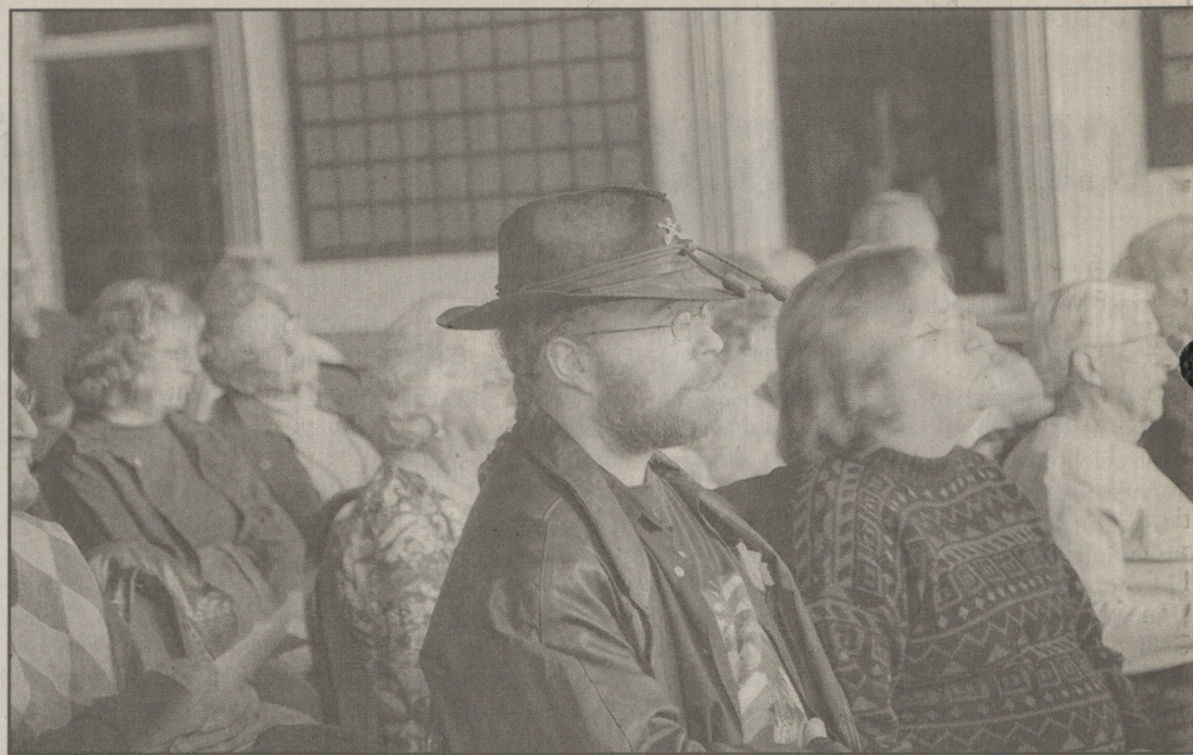
Members of the Noxen community listen to a program of patriotic music sung by area choirs at the Noxen Community Center.

Memorial donations to St. Paul's Lutheran Church, RR 4, Box 627A, Dallas, PA 18612 or the American Diabetes Association, 1701 N. Beauregard St., Alexandria, VA 22311.