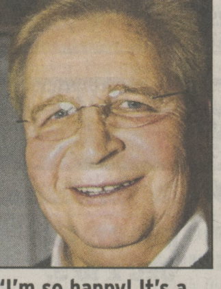
"I'm so happy! It's a great powerful Republican sweep."