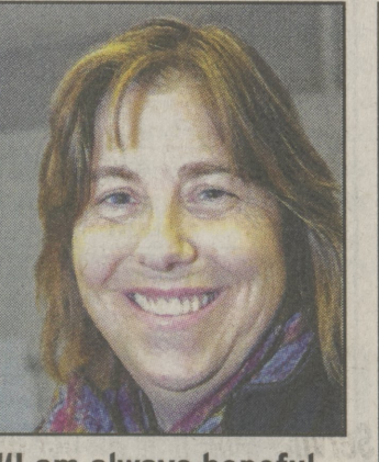
"I am always hopeful that there will be good changes."