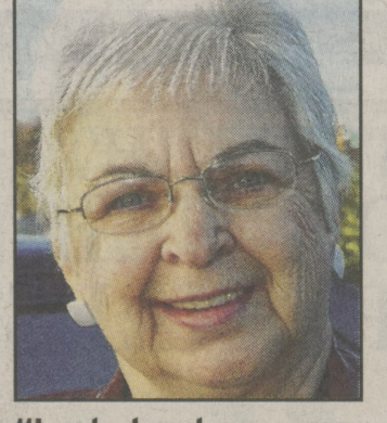
"I voted and am a very disappointed Democrat, especially in the governor's race."