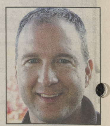
"I am very happy Republican, especially with the congressional race and Lou Barletta getting in."