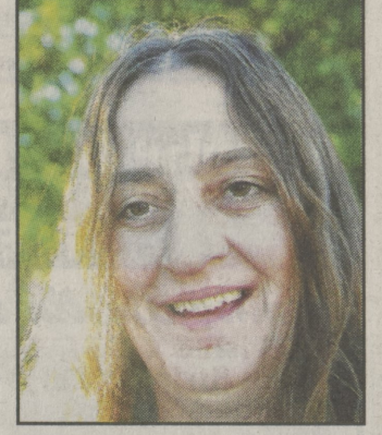
"I want to see it get better but I didn't vote and don't follow it."