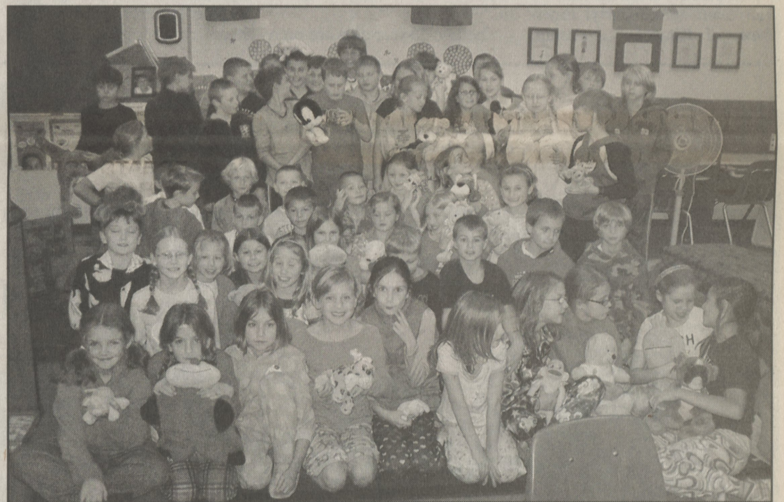
Students at Dallas Elementary concluded Red Ribbon Week on Friday, Oct. 22 with "Hugs not Drugs Day." Students dressed in their pajamas and brought their favorite stuffed animal to hug throughout the day. Red Ribbon Week is a drug-awareness program that features different themes every day of the week to promote a drug-free lifestyle. Pictured above are fifth-grade members of the school's Character Council, a group of students nominated by teachers to participate in school and community programs throughout the year.