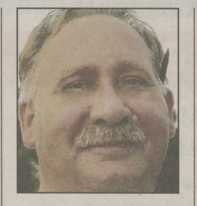
"Australia and New Zealand - it just looks beautiful."