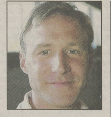
"I'd love to go to South Africa and see the Amazon rainforest."