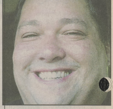
"Disney - the greatest place on earth. I've been there nine times and would start in Animal Kingdom with the rapid run."