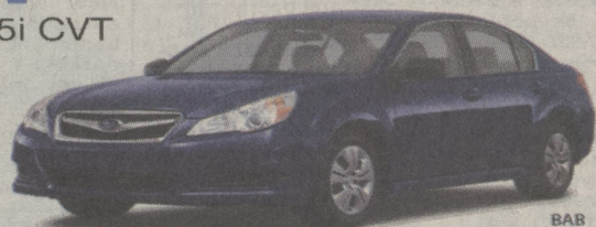
SK# 81095 BAB

ONLY $21,362 or lease for $207/ 36 Months