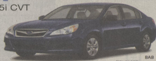
SK# 81095 BAB

ONLY $21,362 or lease for $207/36 Months