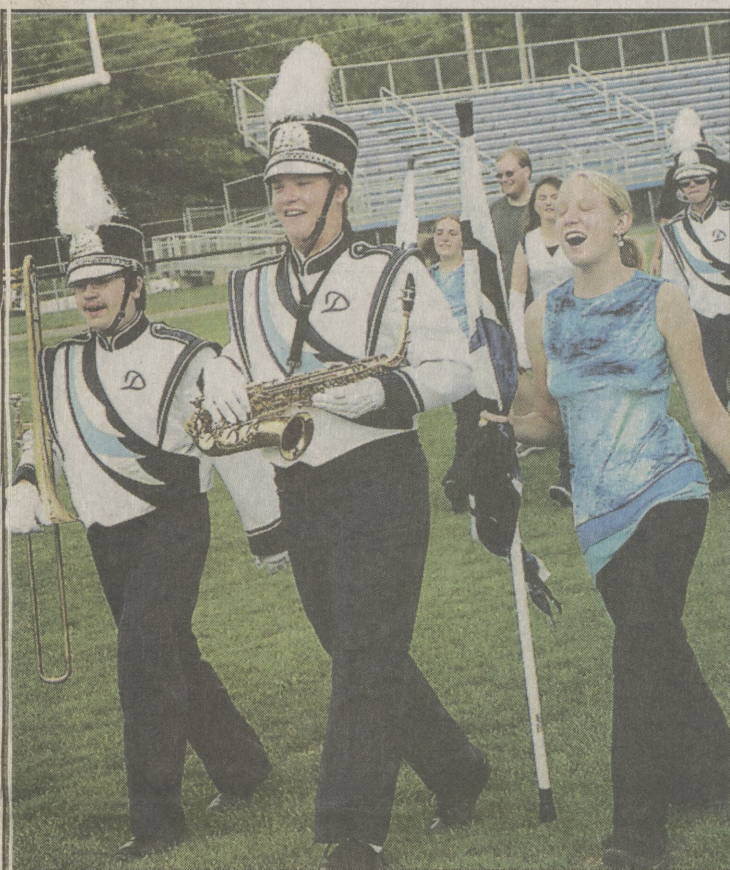
The Dallas High School Marching Band prepares for the upcoming football season.