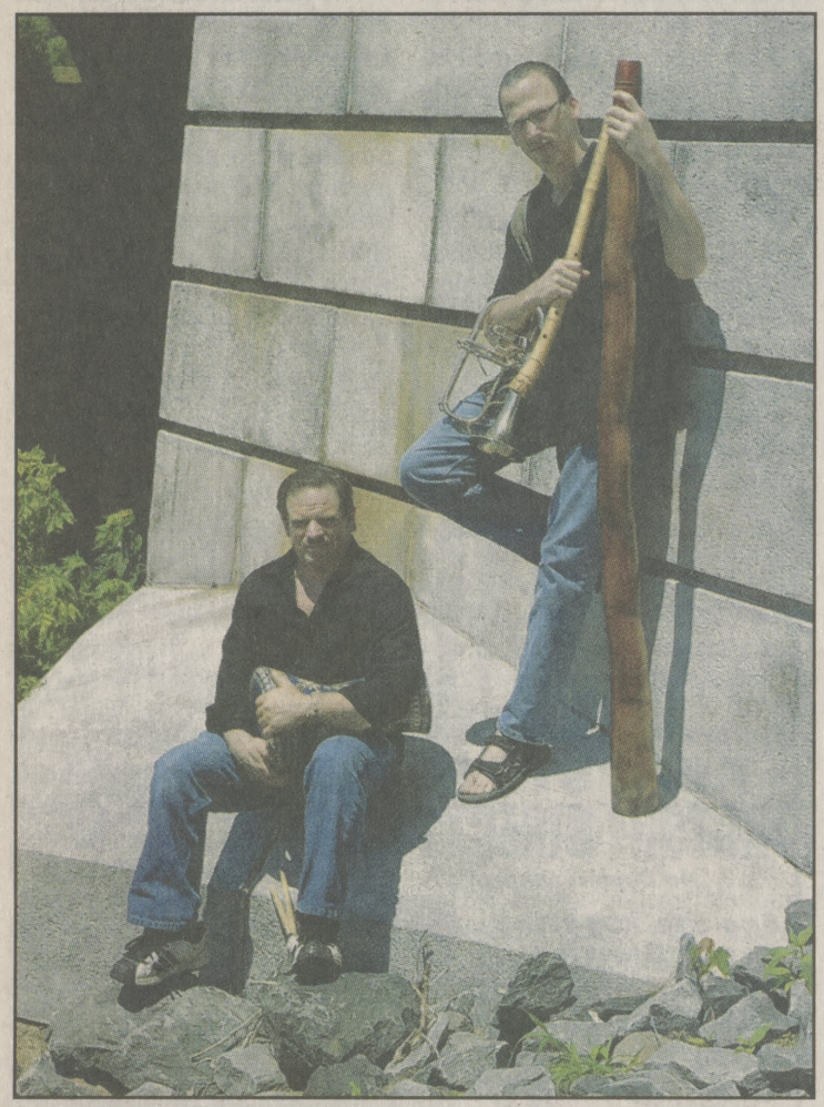
Tribal Waves will offer cultural new wave music at the 26th Annual Arts at Hayfield Summer Festival on Aug. 29 at Penn State Wilkes-Barre.