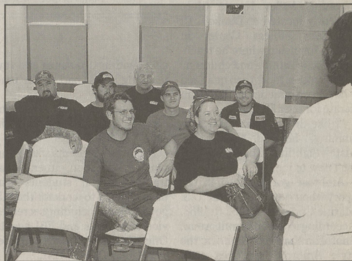
Workers from Selman & Associates in Midland, Texas are welcomed to a Red Cross blood donor site in Beaumont.