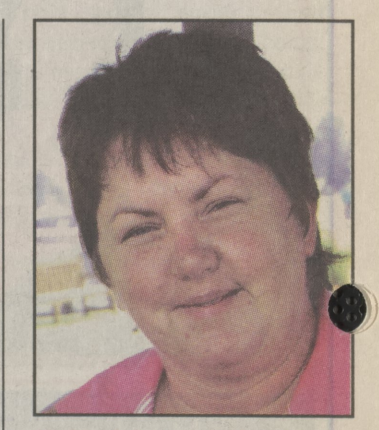
"I just joined the Harveys Lake Beach Association."