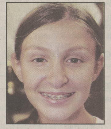
"My house - we have a community pool there."