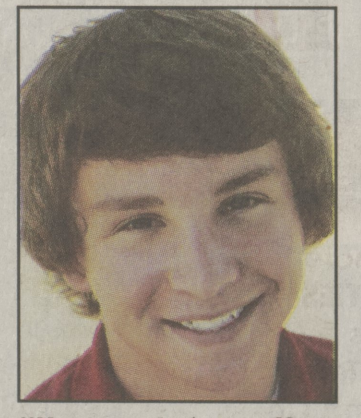
"Harveys Lake - off the dock at a friend's house."