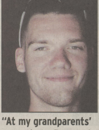
property on Bowman's Creek in Noxen. They say it's the best hole for swimming."