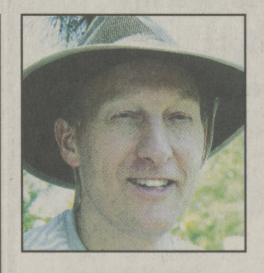
"Seeing the sun out more, doesn't even matter what the temperatures is."