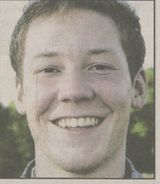
"My dad and I chased a bat that came into my house. We didn't catch it but we laughed trying to get it out. He's a fun guy."