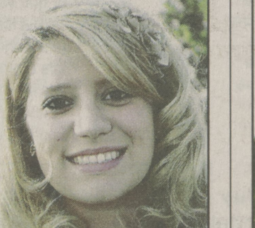
"Dad calls me every day on my cell to make sure my bed is made and that I brushed my teeth. And I'm 19."