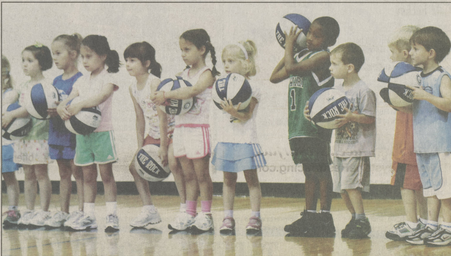
Boys and girls line up to learn basketball skills at the annual Rock Rec Center Summer Basketball Camp in Trucksville.