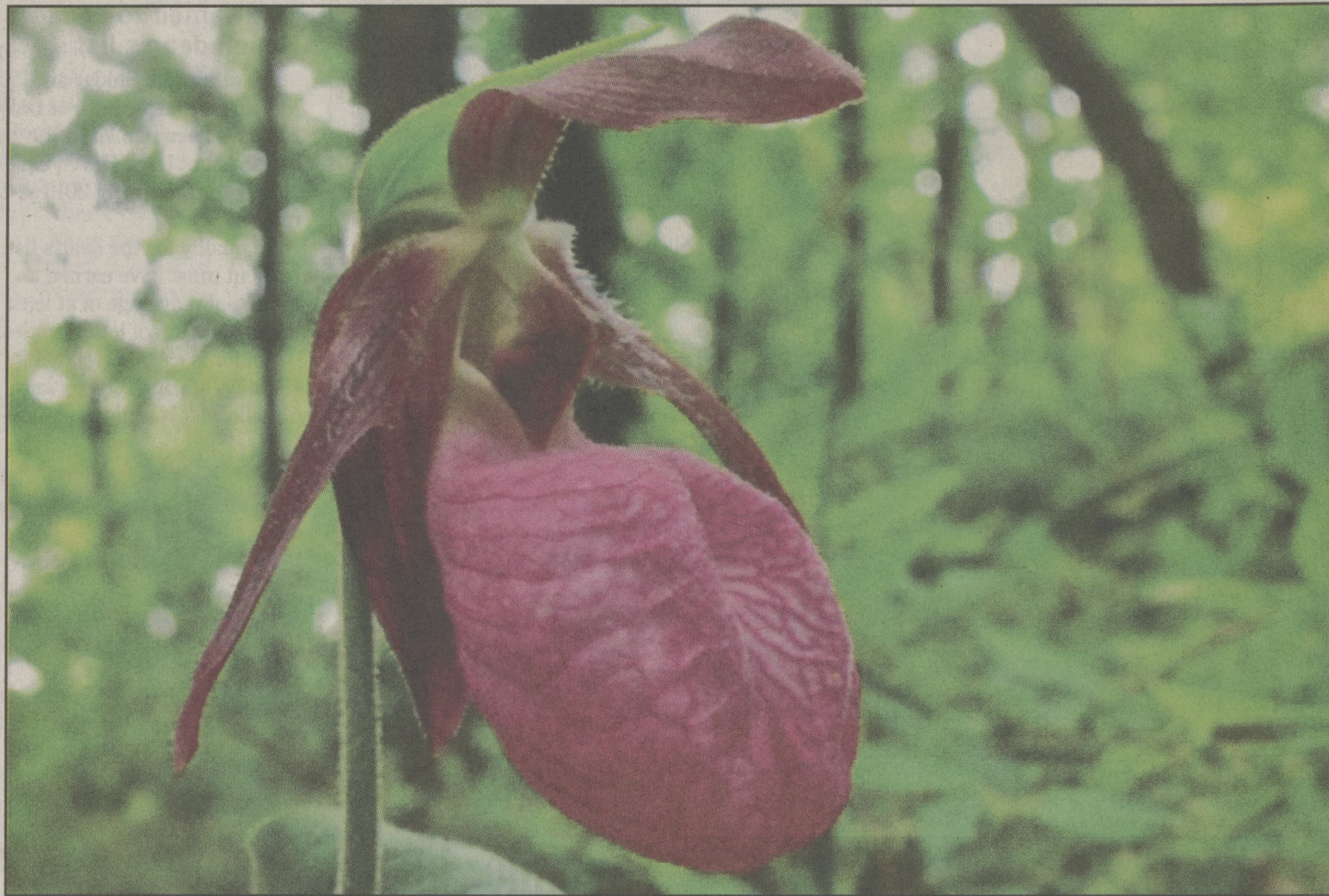
This wild moccasin flower was