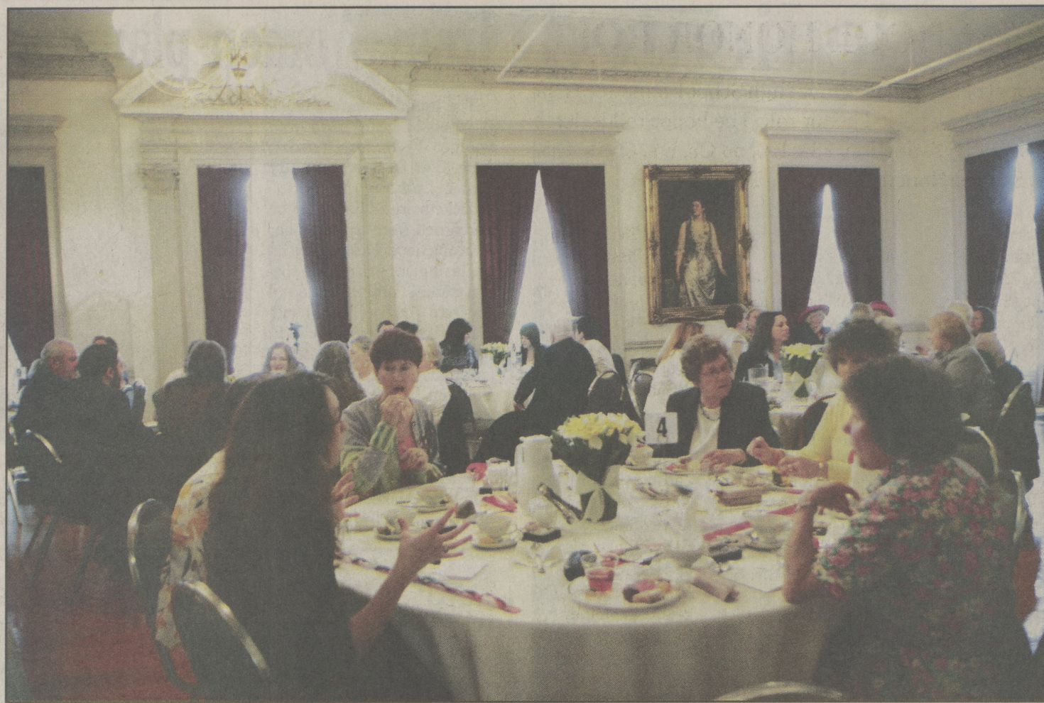
The Third Annual Lake-Lehman Foundation High Tea at Hayfield was held in the Hayfield Ballroom at Penn State Wilkes-Barre.