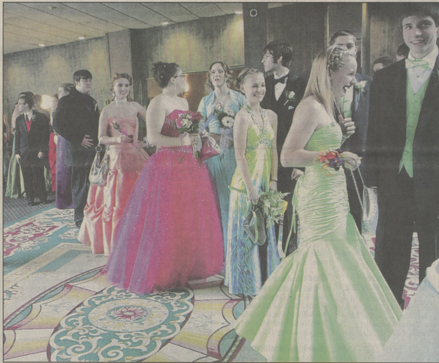
The vestibule at Gennetti's in Wilkes-Barre is awash in bright floral-colored evening gowns for the Dallas Senior High School prom.