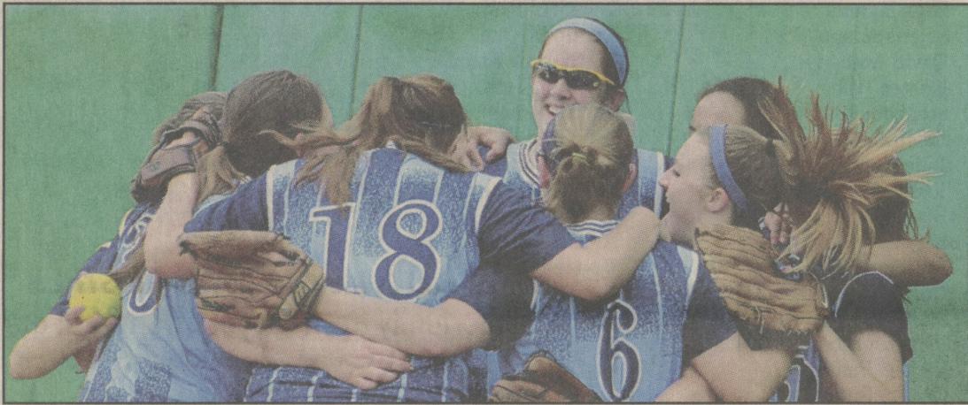
The Dallas girls softball team set out to defeat Pittston Area and did just that, taking home a 4-1 victory.