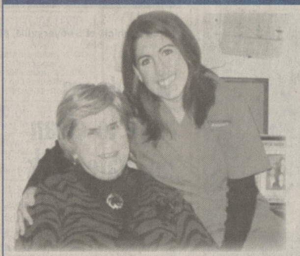
Initial and 90-day Registered Nurse Assessment at no cost. Bonded, Screened, and Insured State Licensed Home Care Agency. Locally Owned and Operated.