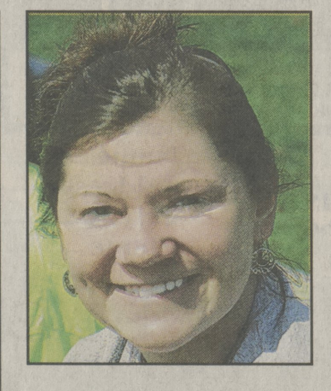
"Because I'm a student teacher, I watch once in a while -Dancing with the Stars and The Bachelor."