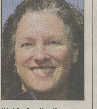
"A big family dinner, an Easter drama at church and just celebrating the resurrection of Christ."