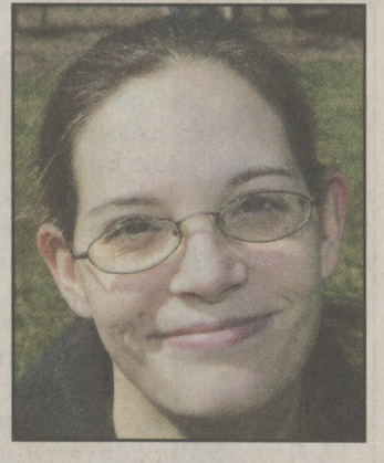
"We hide Easter baskets in the house and go to the Dallas Easter Egg Hunt."