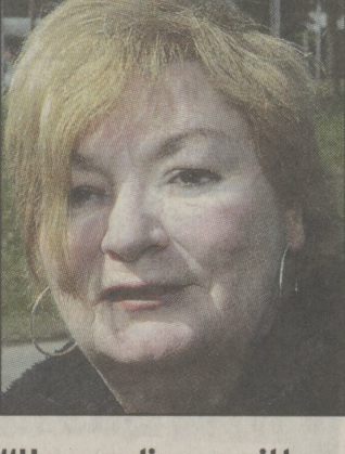
"Have a dinner with about 14 people. I make ham, sweet potato and a poppy seed roll."