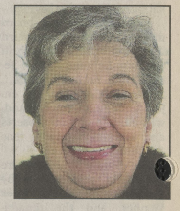
"With tradition, we sit Good Friday from noon to 3 and dye Easter eggs, then go to church each day through Sunday."